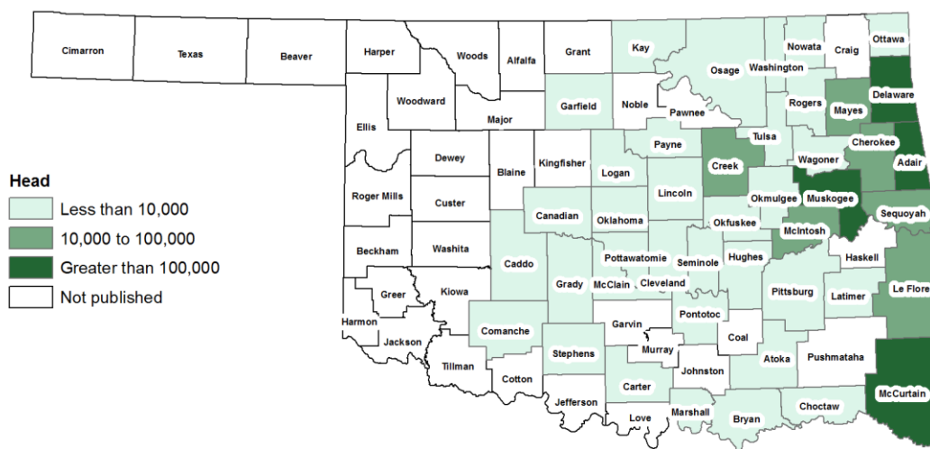
Layer Inventory, December 1, 2017

3 Price per pound is calculated as the total value of sales divided by pounds sold.