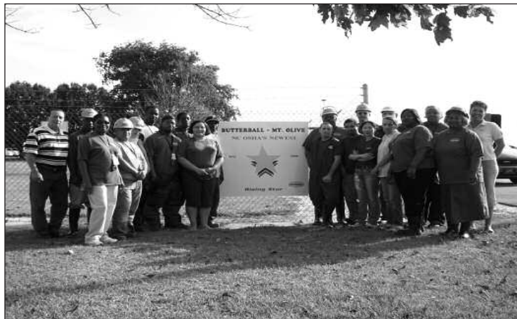
Pictured are employees of Butterball LLC in Mt. Olive celebrating their Star Award.

Parallel breeding programs and integrated distributors on five continents support Aviagen's global distribution network and secure a consistent supply of quality products. Local technical service teams, supported by international specialists, ensure customers achieve the best possible performance from their Aviagen stock.