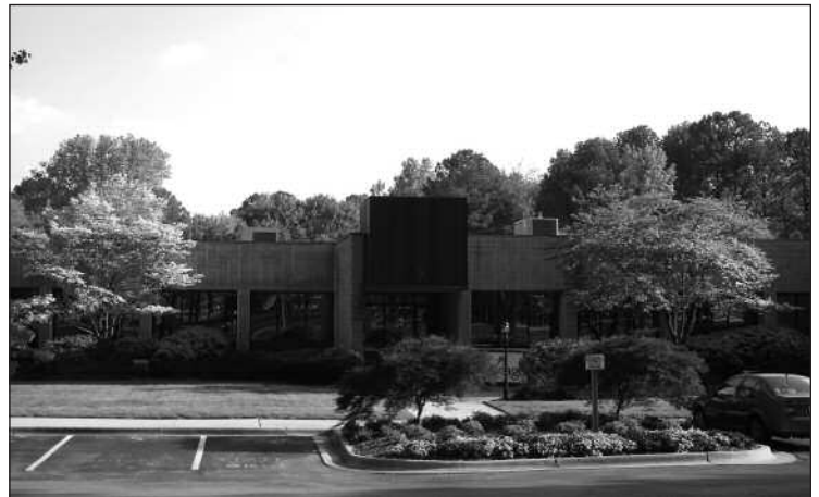
Pictured is Aviagen headquarters in Huntsville, AL.