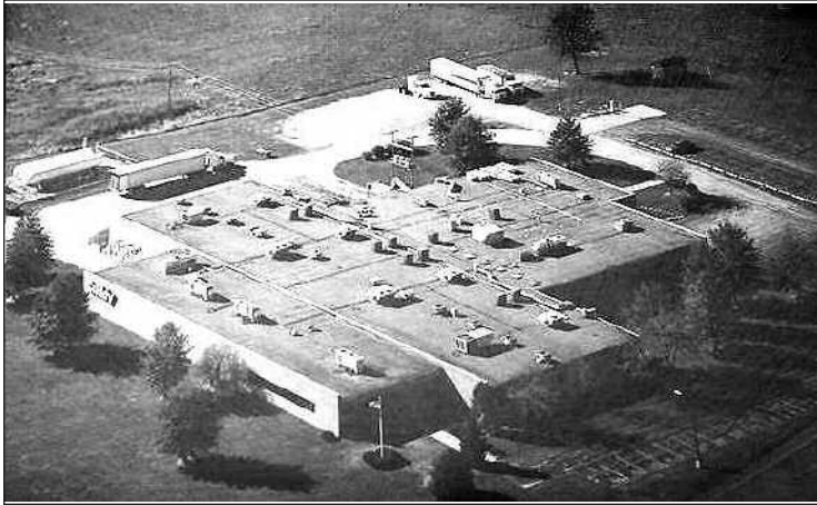
Pictured is AgForte's hatchery located in Aurora, MO.

This is the first in a series of company profiles we will be publishing in our bi-monthly newsletter about our member poultry companies. Thank you to Ag Forte LLC, Aviagen Inc, and Butterball LLC for participating.